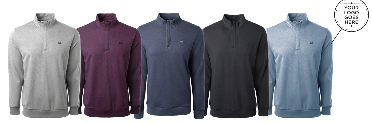
Heather Light Grey

OUR MOST COMFORTABLE PRODUCTS WITH ELEVATED STYLING AND MODERN FITS.