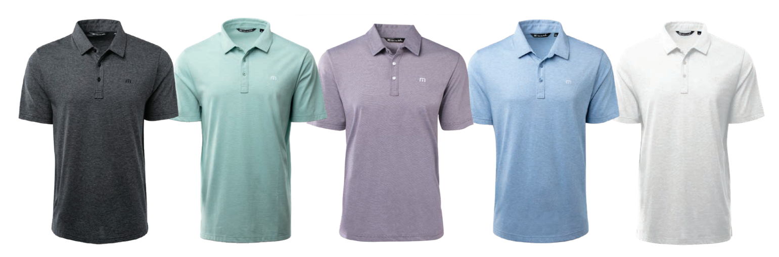
Vintage Indigo / Black